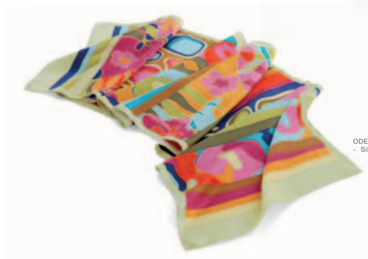
ODE TO JOY OF LIFE - Silk scarves