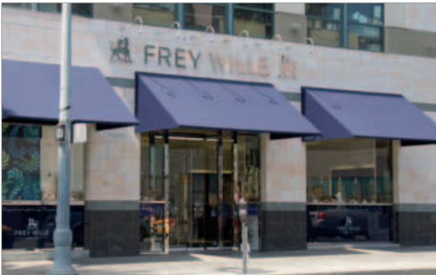
USA LOS ANGELES