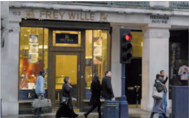
LONDON REGENT STREET