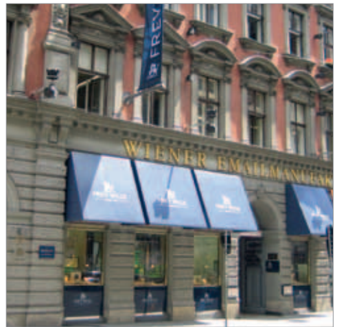
FREY WILLE Headquarter