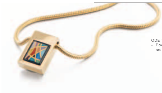
ODE TO JOY OF LIFE - Booklet pendant with snake chain

Each collection consists of several sets – different interpretations of the collection theme. A set consists again of different products: