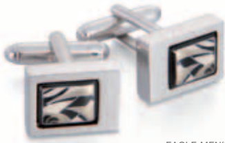
EAGLE MEN'S COLLECTION - Cufflinks - Belt