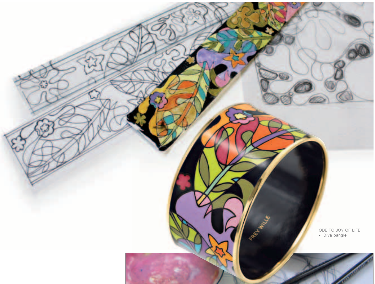
ODE TO JOY OF LIFE - Diva bangle