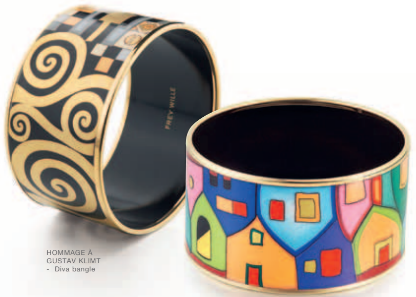
HOMMAGE À GUSTAV KLIMT - Diva bangle