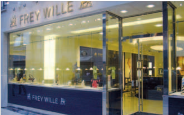
HAMBURG NEUER WALL