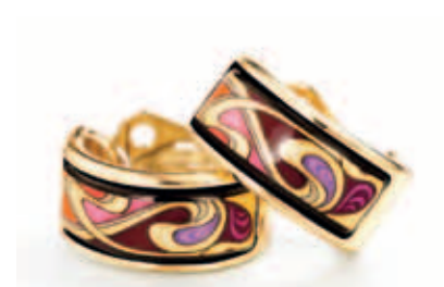
HOMMAGE À ALPHONSE MUCHA - Creole earrings