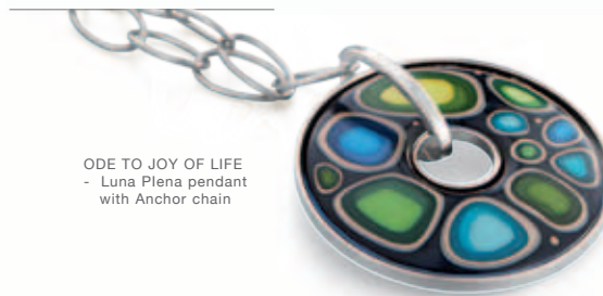
ODE TO JOY OF LIFE - Luna Plena pendant with Anchor chain

The client can combine his / her own set immediately or extending over several years.