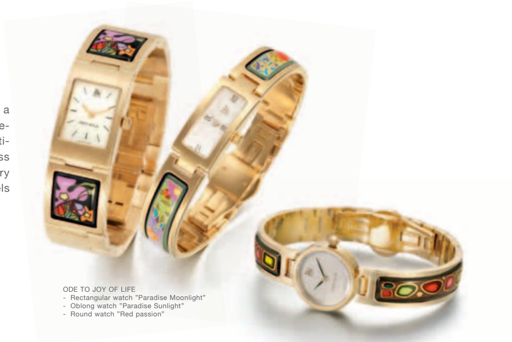
ODE TO JOY OF LIFE - Rectangular watch "Paradise Moonlight" - Oblong watch "Paradise Sunlight" - Round watch "Red passion"

The elegant jewellery watches are a perfect union of jewellery and a time-piece. As a combination of the artistic high quality design and the Swiss ETA quartz clockwork the jewellery watches are designed in different models (Round, Rectangular and Oblong).