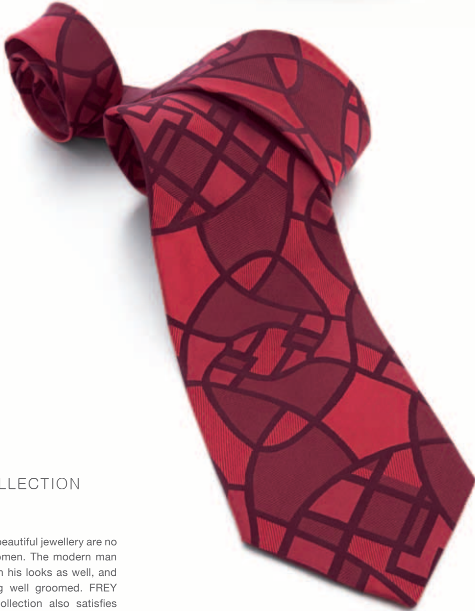
RALLYE MEN'S COLLECTION - Tie