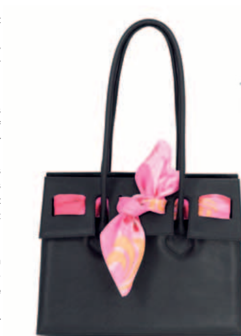
DESIGNER BAG "GLORINETTE"

The FREY WILLE accessory-collection bags can be worn with scarves threaded through the pocket flaps. These can be applied and changed at will. High quality leather guarantees wear resistance and longevity.