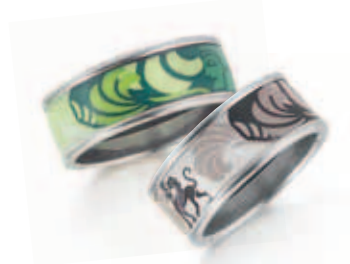
SPHINX FASHION KOLLEKTION - Wide rings